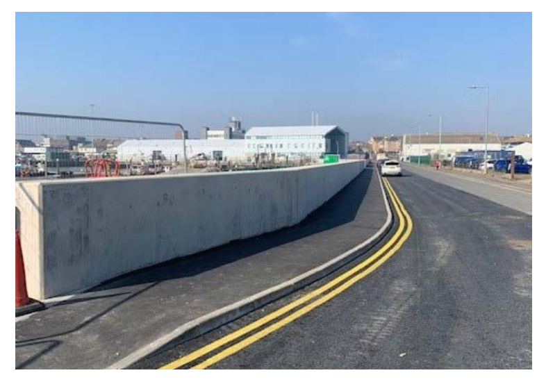
Completed tidal wall on Hamilton Road.