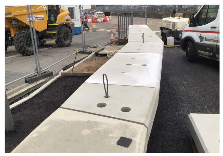
Coping stones near the Port entrance on Waveney Road.