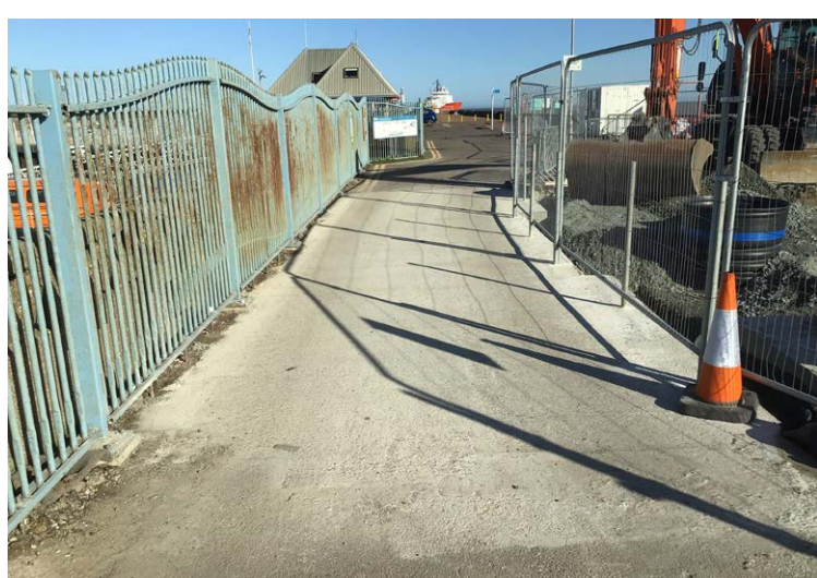
Temporary access to the South Pier.