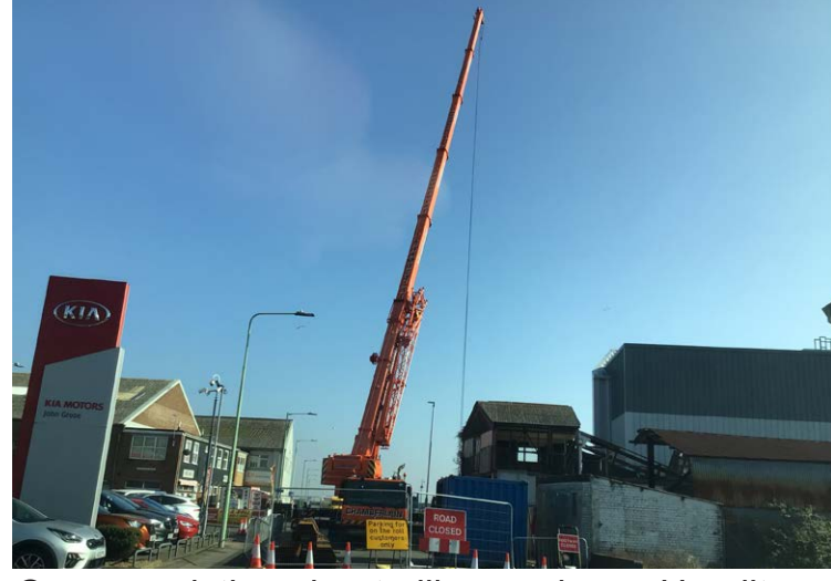
Crane assisting sheet piling works on Hamilton Road.