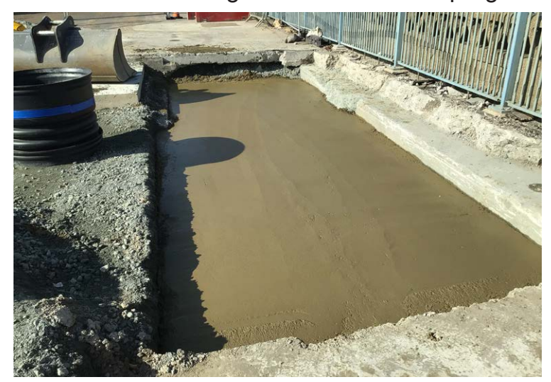
Concrete pour on the South Pier.

Construction on the tidal flood walls on Waveney Road and Hamilton Road continues. Work on the South Pier has paused over the summer months to prevent any impact on tourism the construction might bring, work will recommence in the autumn. Below are a selection of images which show our progress.