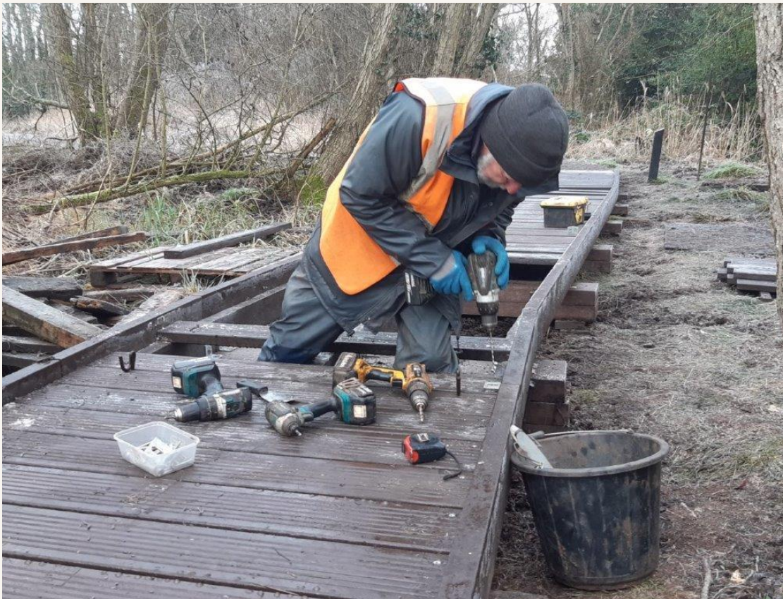
Work to replace the old boardwalk at How Hill

A huge thanks to the many volunteers and staff who helped with this mammoth task – the boardwalk is now open to the public and ready to go.