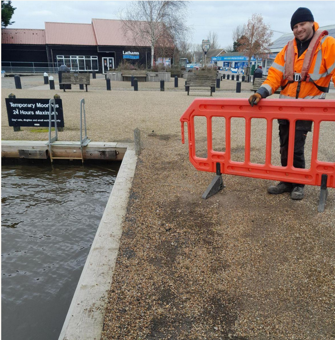
Potter Staithe after being cut back and lined