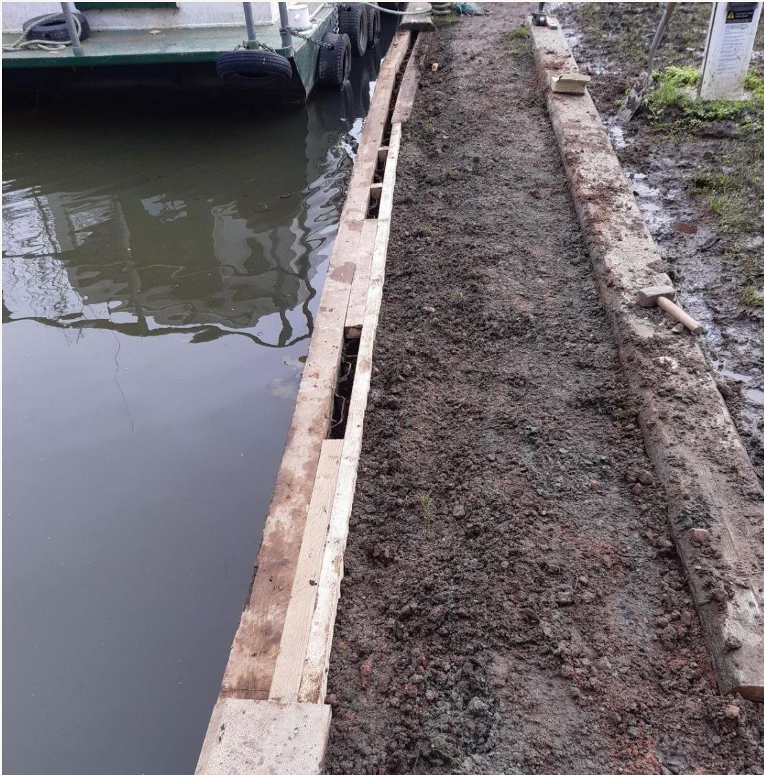
A photo taken surfacing and timber replacement works at Dilham