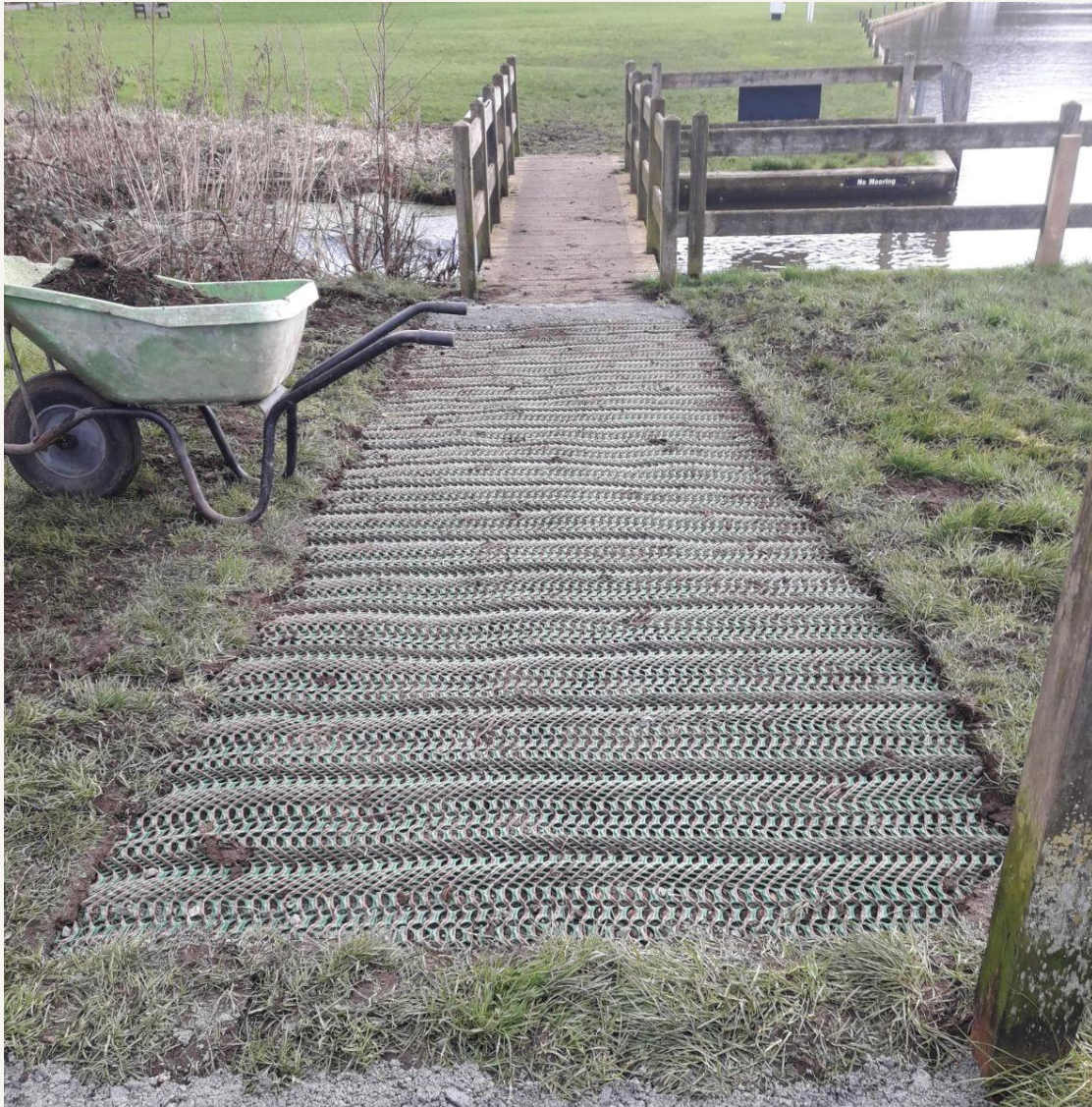
Accessible mooring matting replaced at Coltishall