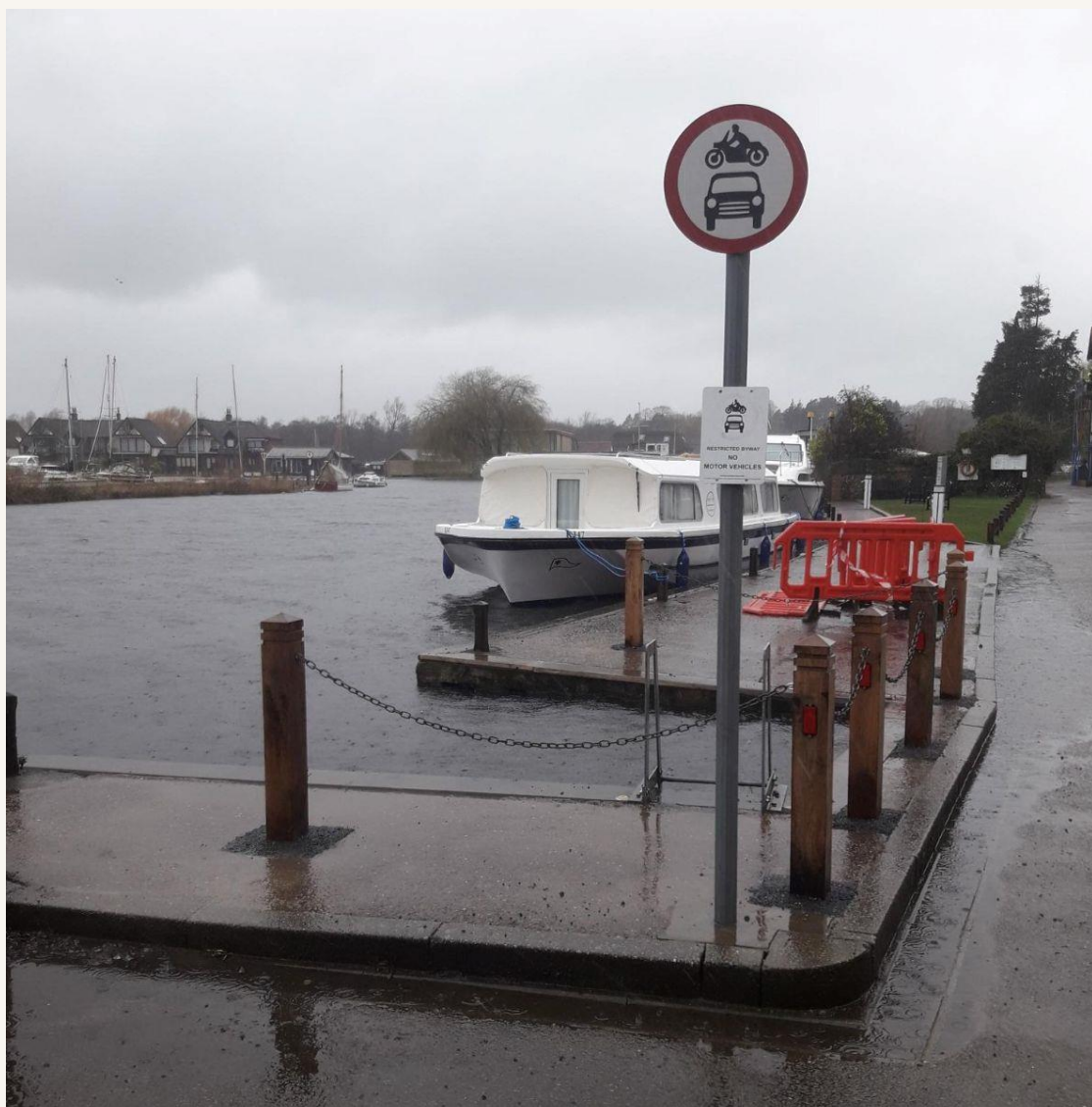
7 new posts installed at Horning Staithe