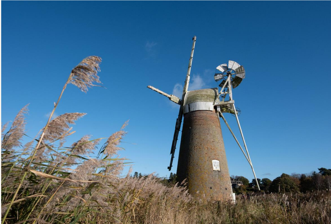
Turf Fen mill

Read more on our website: https://www.broads-authority.gov.uk/news/turf-fen-mill-to-receive-restoration-grant-from-historic-england